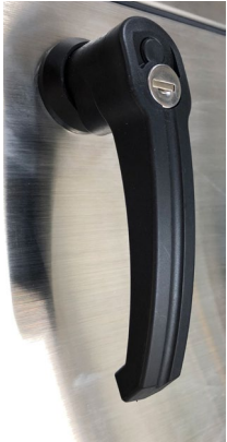
(H4) Removable Flush Locking Handle