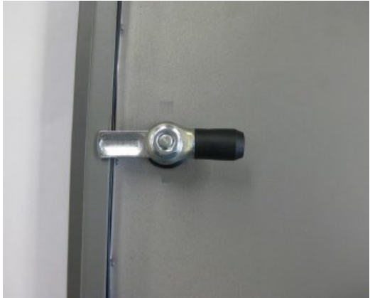
Inside Latch for (H4) Removable Flush Locking Handle