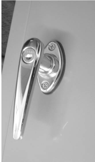
H3 Locking Handle