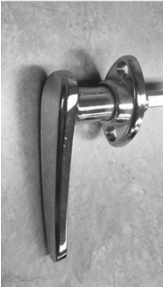
H2 Non-Locking Handle (Standard)