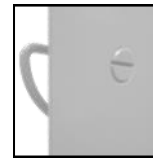
Standard Cam Latch