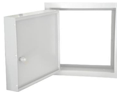
STC-1212F3W Above in White

ASTM E1332-10a Standard Classification for Rating Outdoor-Indoor Sound Attenuation