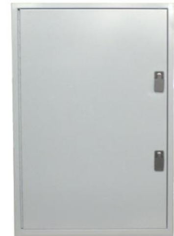
STC-2436F3G in Gray