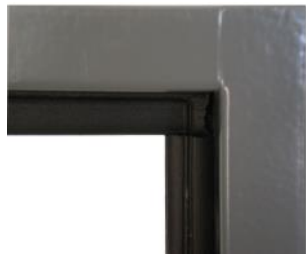
Gasketing: Heavy Duty EPDM Rubber

THE STC ACCESS PANEL CAN BE INSTALLED IN A WIDE RANGE OF STC-RATED WALLS THE DRAWING ABOVE IS AN EXAMPLE ONLY