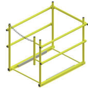
SHWC-3636 SHOWN WITH STANDARD GRAB BAR (Standard with 36" and Greater Egress Side Opening)

Contact Customer Service for Custom Requests.