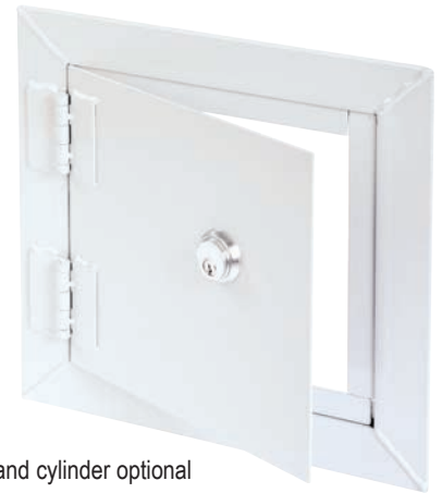
lock and cylinder optional