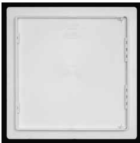
PA-3000 View of door back