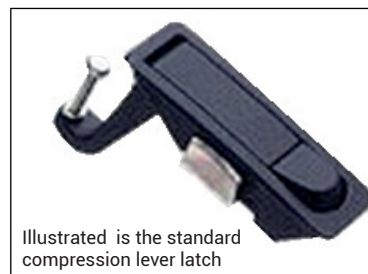
Illustrated is the standard compression lever latch

(Dimension) Denotes Millimetres Note: The hinge is always furnished on the "A" or height (longer) dimension, unless otherwise specified. Example: the model number would be FHG4872 for a floor access door with the hinge on the longer (72") dimension. The model number would be FHG7248 for a floor access door with the hinge on the shorter (48") dimension.