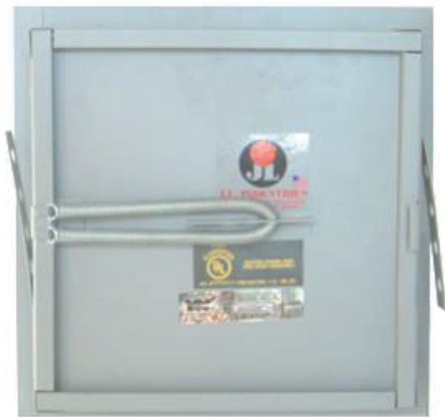
SPRING-ASSISTED CLOSING OF FD PANELS

JL Industries' innovative line of fire-rated access panels for every type of installation meets testing standards: UL10B, CAN/ULC-S104, ASTM E152. Access panels are rated to 1-1/2 hours for 2 hour fire barriers for vertical surfaces in sizes up to 48" x 48" (24" x 48" for Heavy Gauge). All models feature a 2" thick insulated door, slam latch with spring-assisted closer and welded on masonry anchors. Minimum size 8" x 8".