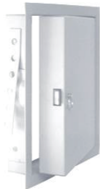
DETAIL OF WALL MODEL