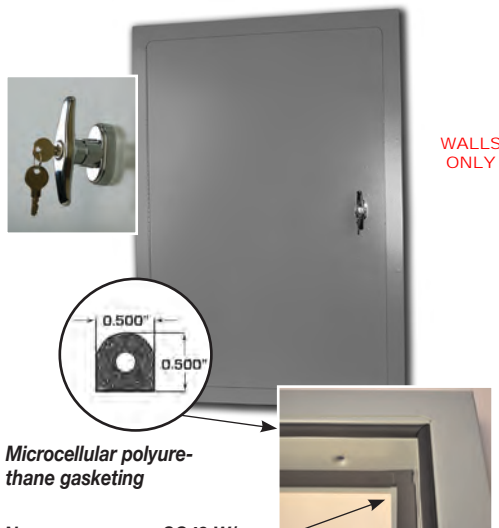
Microcellular polyurethane gasketing