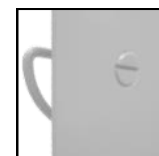
Standard Cam Latch