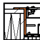
Angle Frame Both-In