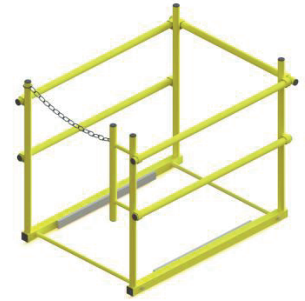
SHWC-3636 SHOWN WITH STANDARD GRAB BAR (Standard with 36" and Greater Egress Side Opening)

Contact Customer Service for Custom Requests.