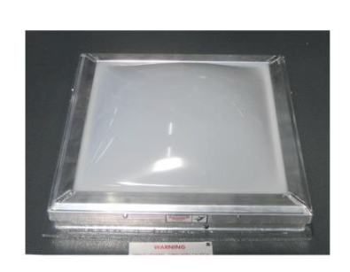
Detail of Dome Construction