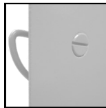
Standard Cam Latch